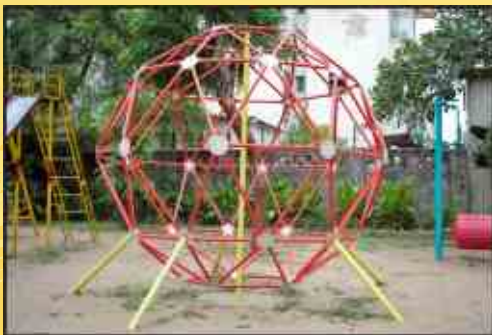
Crystal Maiz Climber 8'H X 8'W