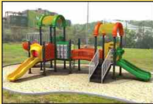
Plastic Molding Multiple System Two Tower