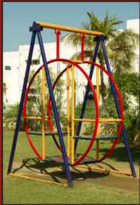
Circular Swing 6'H X 6'W