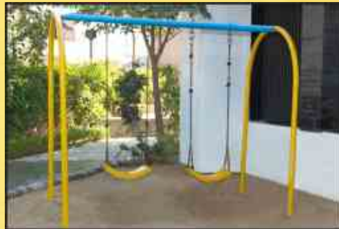
Arch Swing Two Seater 8'H X 8'L X 4'W