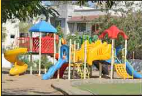
Plastic Molded Multiply System Three Tower