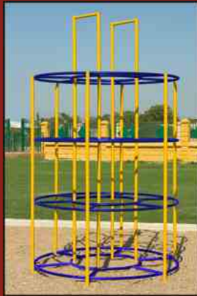
Jungle Jim Round 8'H X 6'W