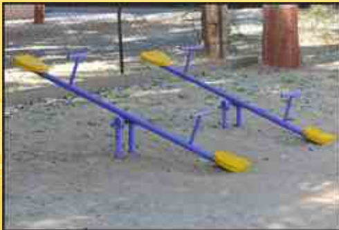
See Saw Double 7'L X 5'W X 1.5'H