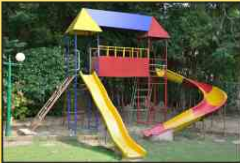
Multi Children Set Two Tower