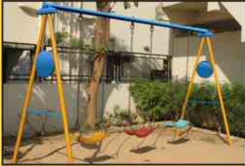
Swing Three Seater 8'H X 12'L X 4'W