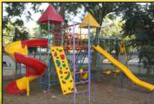
Multi Children Set Two Tower