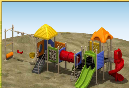
Plastic Molded Multiply System Four Tower