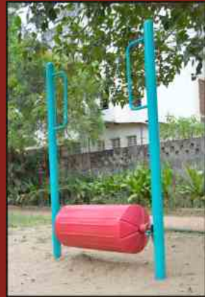
Walking Barrel 7'H X 4'W