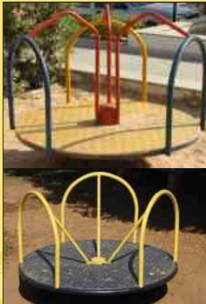
Platform Merry Go-Round