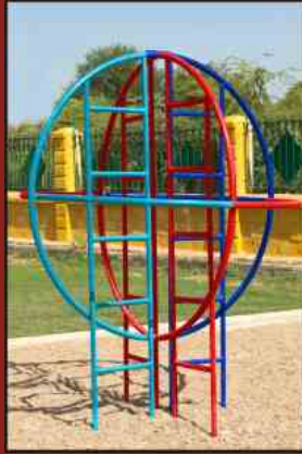
Criss-Cross Climber 8'H X 5'W