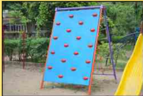
Rock Scrambler 7'H X 5'W