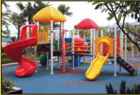
Plastic Molded Multiply System Five Tower