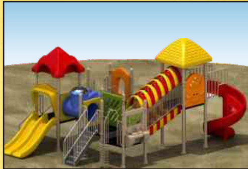
Plastic Molded Multiply System Three Tower