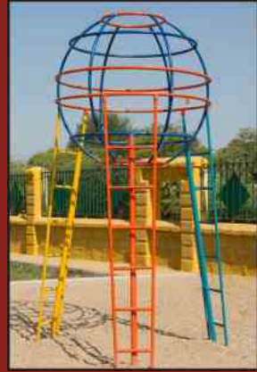
Satellite Climber 10'H X 6'W