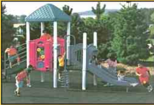
Plastic Molding Multiple System Single Tower