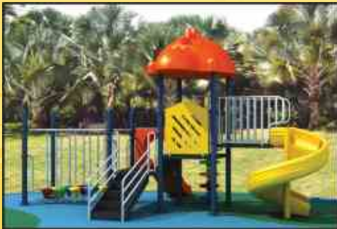
Plastic Molded Multiply System Single Tower