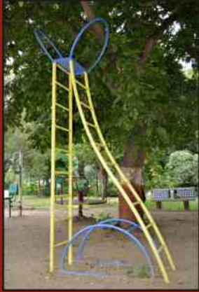
Giraffe Climber 10'H X 3'W