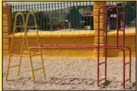
A to B Climber